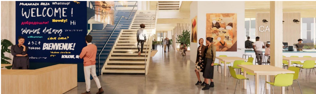
Figure 2: Architect's rendering of Welcome Center lobby