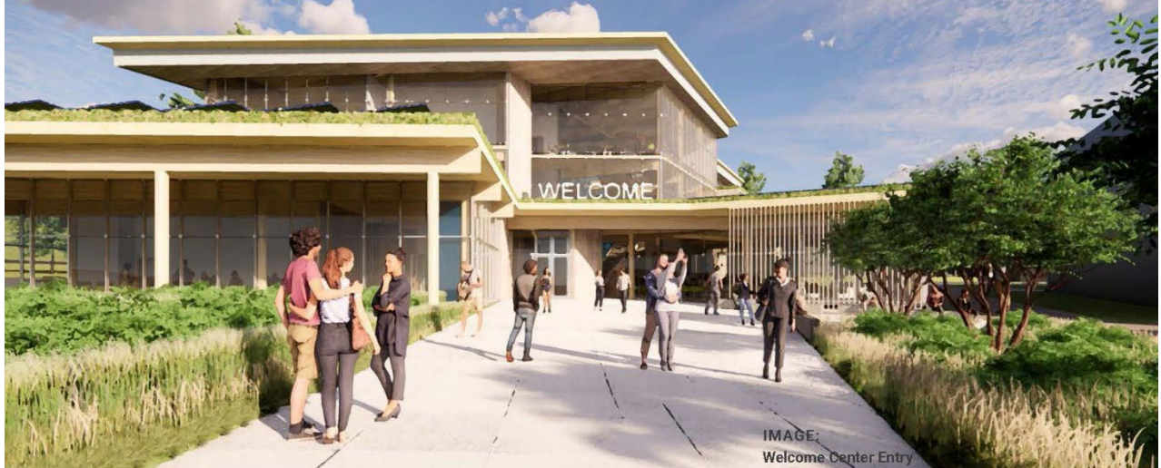
Figure 1: Architect's rendering of the exterior of the Student Development and Success Center

In response to the challenges identified above, Western is proposing the Student Development and Success Center. The Project will create an approximately 41,000 gross square foot facility that will provide: