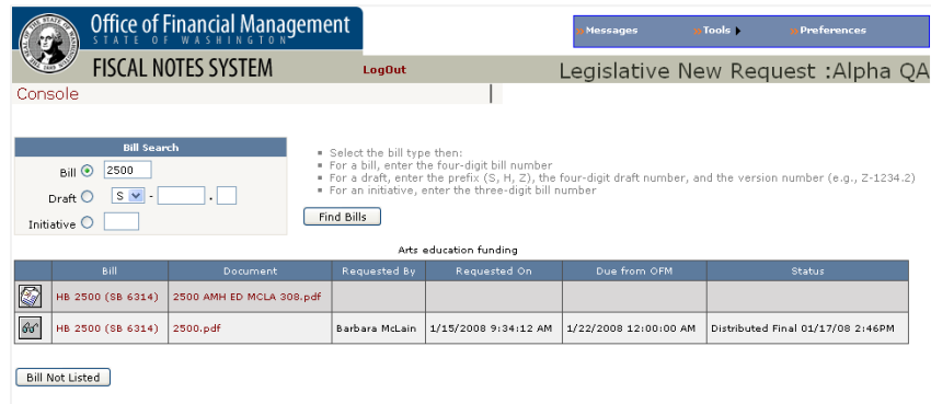
Figure 2: Legislative new request page

The table will indicate if requests have been made on any bill versions shown in the table, with the requester, the date requested, the due date and an indication of the fiscal note status (e.g. - unassigned, in process and distributed).