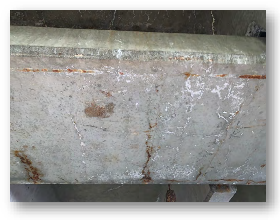
Photo 4: Joints between precast structural members showing water intrusion. Continued intrusion will cause failure of the joint.

Photo 3: Cracks forming in the structural members of the top parking deck. Continued water intrusion causes the cracks to grow weakening the structure and will eventually cause failure of the structure.