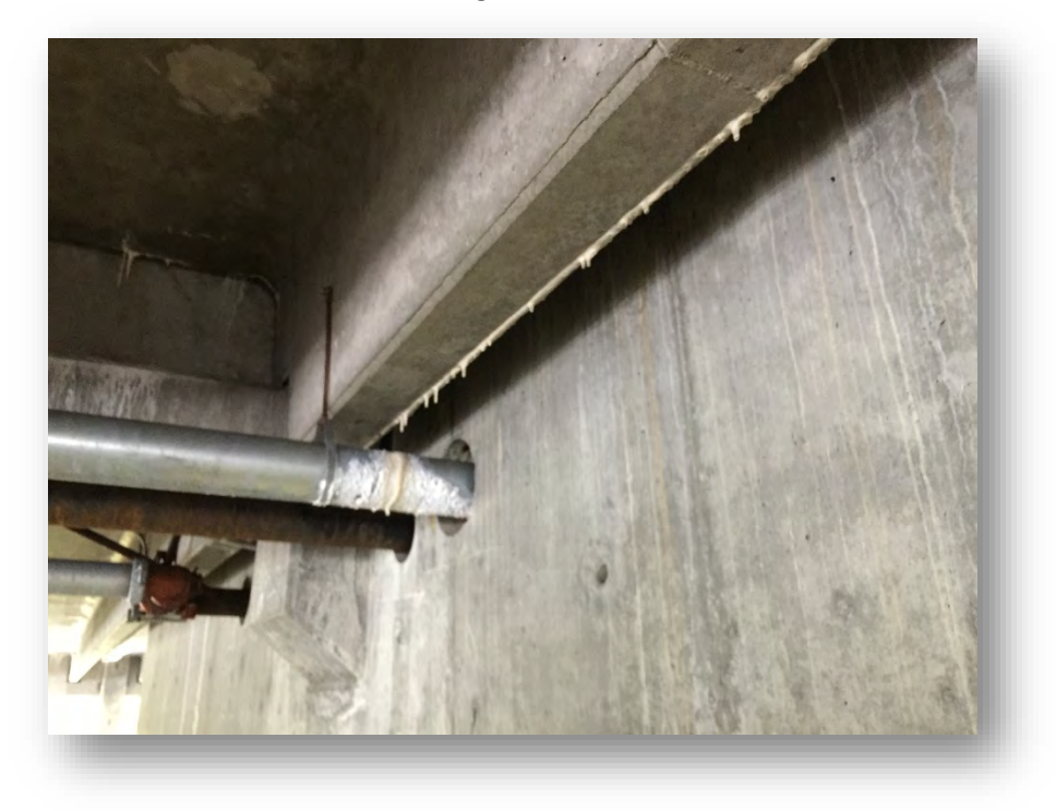
Photo 2: The bright colored pipe is part of the fire sprinkler system and was replaced recently due to corrosion from the leaks. Also cracks in the structural elements of the garage are forming and growing due to the water intrusion.

Photo 1 : Water seeping through the concrete upper parking deck washing the minerals out of the structural concrete elements weakening the overall structure.