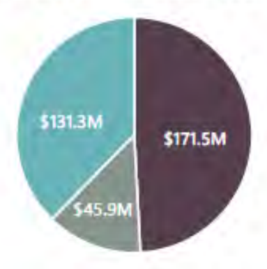
Figure 6: Of the funding requested, how much was awarded, not awarded due to a lack of funds, or did not qualify due to not meeting scoring threshold or having a credible objection?

Anticipated funding need in the FY23 application cycle likely outpaces the $120 million available. Overall, this represents a much-needed investment. Local governments are counting on having the funds to plan and build Washington's next legacy infrastructure systems and support communities to deliver essential public services. Extreme weather events and shifting climate conditions are more frequently impacting communities. Heat waves, wildfires, flood events are all increasing. Infrastructure not only provides essential services, it is the backbone of economic recovery, and is a vital component of community resilience.