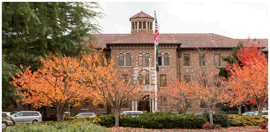
Western State Hospital main entrance

Washington's two primary psychiatric treatment facilities — Western State Hospital and Eastern State Hospital — were built more than a century ago. As demand for behavioral health treatment services has grown in recent