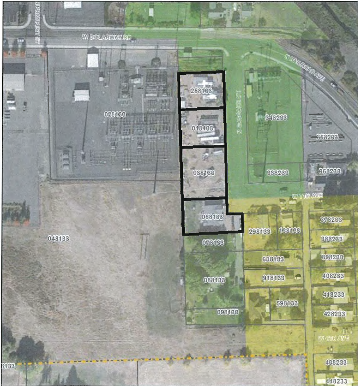
EXHIBIT A: ANNEXATION PARCELS