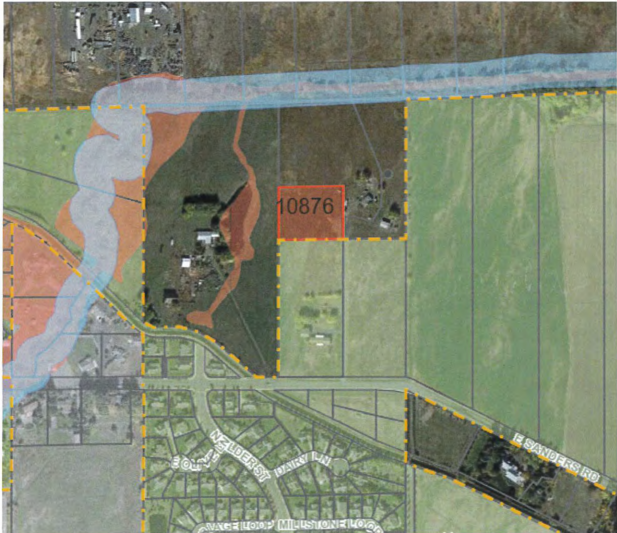
Exhibit A: Annexation Parcel