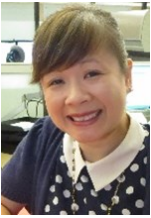
New Program Team Members