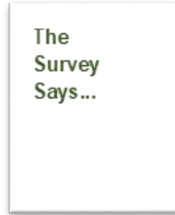
Market Research: "The ERP Experience"