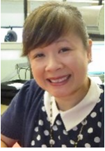
New Program Team Members